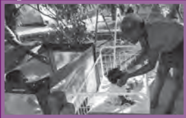
Haitian Relief - pgs. 10-11

NYS approved ECMC Ortho, Rehab program expansions/renovations progressing swiftly - pgs. 8-9