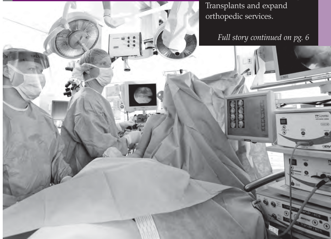
ECMC orthopedic surgical team performs arthroscopic (minimally invasive) shoulder procedure