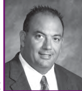
Jody L. Lomeo ECMC Corp. CEO

As we look back at 2009 and turn towards 2010, we have much to be proud of at ECMC. The year 2009 laid the groundwork for a new integrated health system with our partners at Kaleida and positioned ECMC as an important campus for growth of the system.