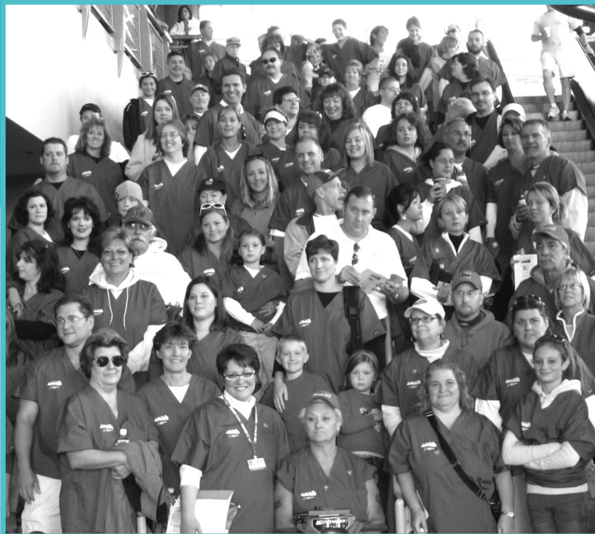
ECMC Corp. Heart Walk Team: A record number of ECMC and Erie County Home employees 'walked the walk' for the 2007 American Heart Walk held September 15.