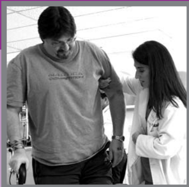
National Patient Safety Week Inside Page 4