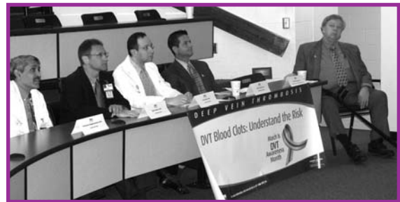
Panel Discussion participating physicians.