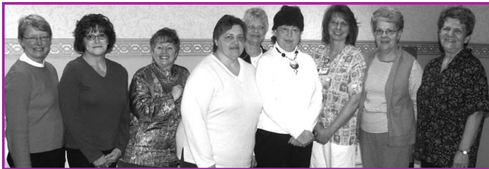
Those retirees who were able to be in attendance pose during their reception.

The following ECMC 2006 Retirees with 10 or more years of service were recognized by Administration at a reception in their honor on March 14th.