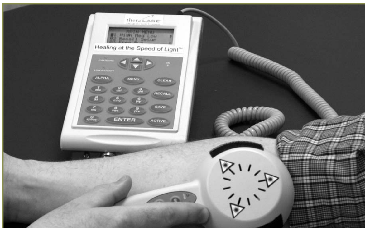
New Theralase Pain Therapy at ECMC

Those individuals interested in this treatment or any other rehabilitation services at ECMC should contact the ECMC Physical Therapy Department at (716) 898-3225.