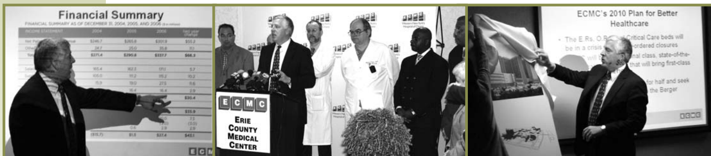
ECMC Board Members, Area Dignitaries and Union Leaders present for positive financial news and unveiling of Heart Center plans.