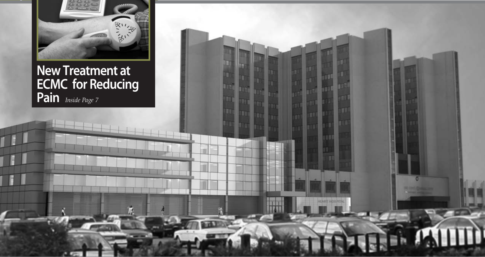
A rendering of the future Heart Hospital at ECMC (Heart and Vascular Care Center)

New Treatment at ECMC for Reducing Pain Inside Page 7