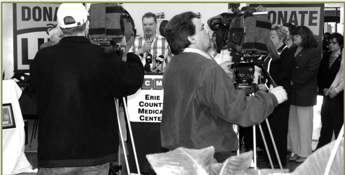
The UNYTS-ECMC news conference in ECMC's Lobby to launch Organ Donation Awareness Month was well-attended and well-reported by WNY news media.

ates as a non-profit serving the eight counties of Western New York and is part of the Buffalo Niagara Medical Campus. It works to assist donor families, coordinate the donation process and increase knowledge and awareness within the community regarding organ, tissue and eye donation.